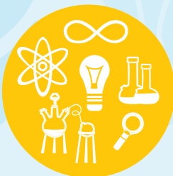
Science & Tech Camp