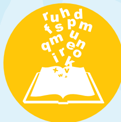
Arts & Language Camp