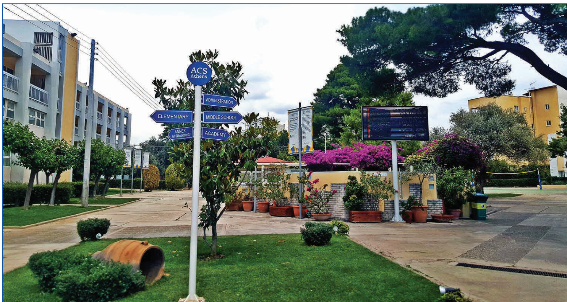
ACS Campus.