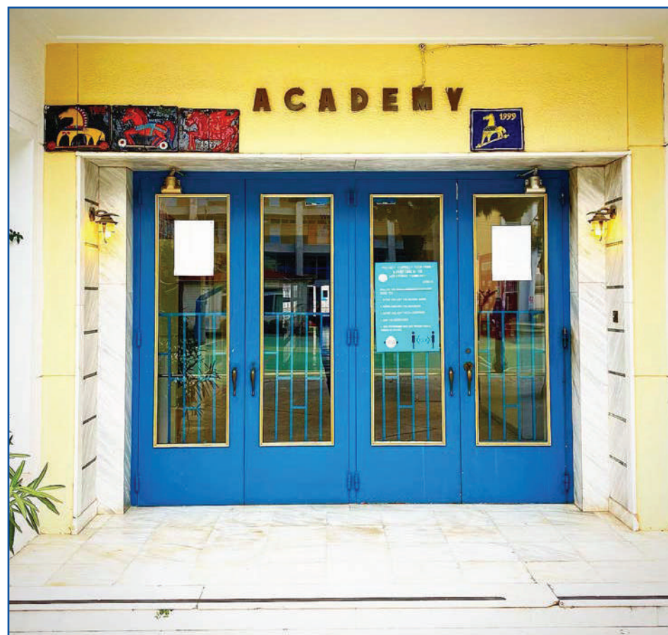
The (famous) Academy blue doors.

Faculty and staff teach ethical decision-making, so students understand their decisions and actions have consequences.